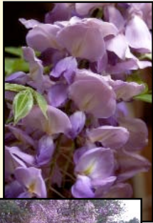
Carol Nourse & Hugh Nourse

( alien, exotic, foreign, introduced, non-indigenous ) A species that occurs artificially in locations beyond its known historical natural range. A species should be considered non-native if it is from a different region, even if from the same country or state.