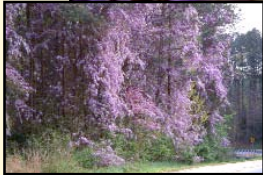
Wisteria, Wisteria sinensis