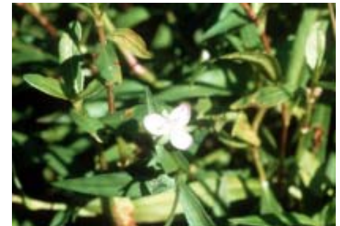
Milo Pym, USDA-NRCS Plants Database