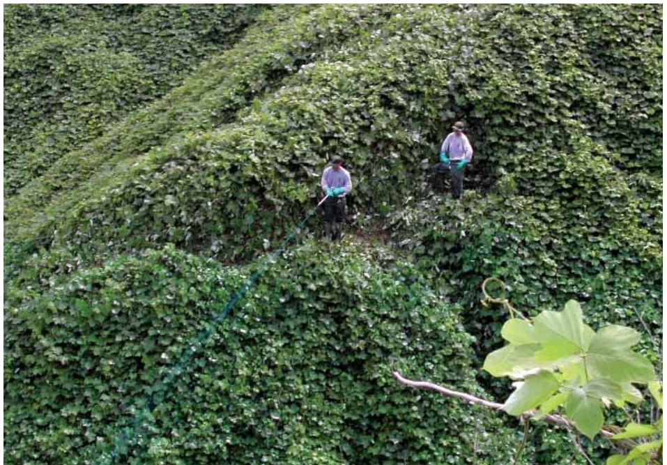
Members of the Gulf Coast EPMT treating kudzu ( Pueraria montana ) on the Natchez Trace Parkway in Mississippi.

Species that have presented some of the greatest challenges to the SE-EPMT include Multiflora rose ( Rosa multiflora ), Garlic mustard ( Alliaria petiolata ) and Callery or Bradford pear ( Pyrus calleryana ). Recently the SE-EPMT worked in the rugged Obed Wild and Scenic River gorge carefully removing multiflora rose from areas containing the federally protected Cumberland rosemary ( Conradina verticillata ). Located in Tennessee, this park boasts one of the richest floras in the southeastern US including, unfortunately, many invasive plants. In March and April at the Big South Fork National Recreation Area in Kentucky and Tennessee, the team attempted to gain a foothold against garlic mustard, hand-pulling over 20,000 plants threatening an area of rich riverine flora. Cumberland Gap National Historic Park, also in Kentucky, provided an unexpected foe, the Callery pear. Work in this park