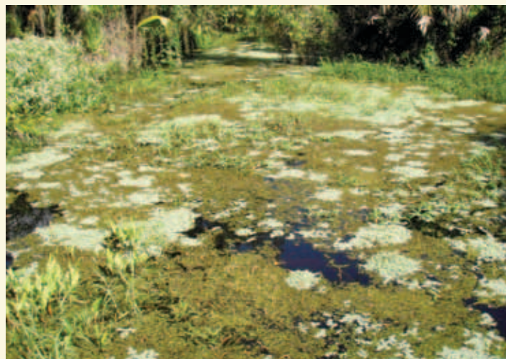
Figure 1. Phyllanthus fluitans growing in a canal. Aggregates of this species appear light blue-green.

Clusters of adventitious roots arise from older stem portions and extend into the water. The roots of a cluster emerge primarily