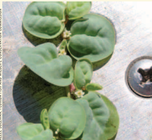
KELLE SULLIVAN, FLORIDA FISH AND WILDLIFE CONSERVATION COMMISSION