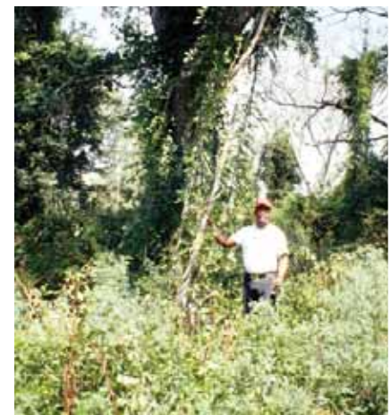
Transline plot the second summer after retreatment