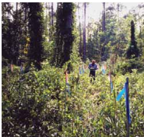
Wisteria control study site before treatments

This test found that a range of herbicides can be effectively used for wisteria control depending upon the situation and the necessary safety to surrounding vegetation and revegetation. It should be recognized that invasive plants demand high levels of efficacy by any treatment to be successful in eradication and rehabilitation. High rates and/or repeated applica-