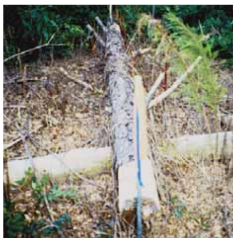
Tordon K plot the summer after treatment