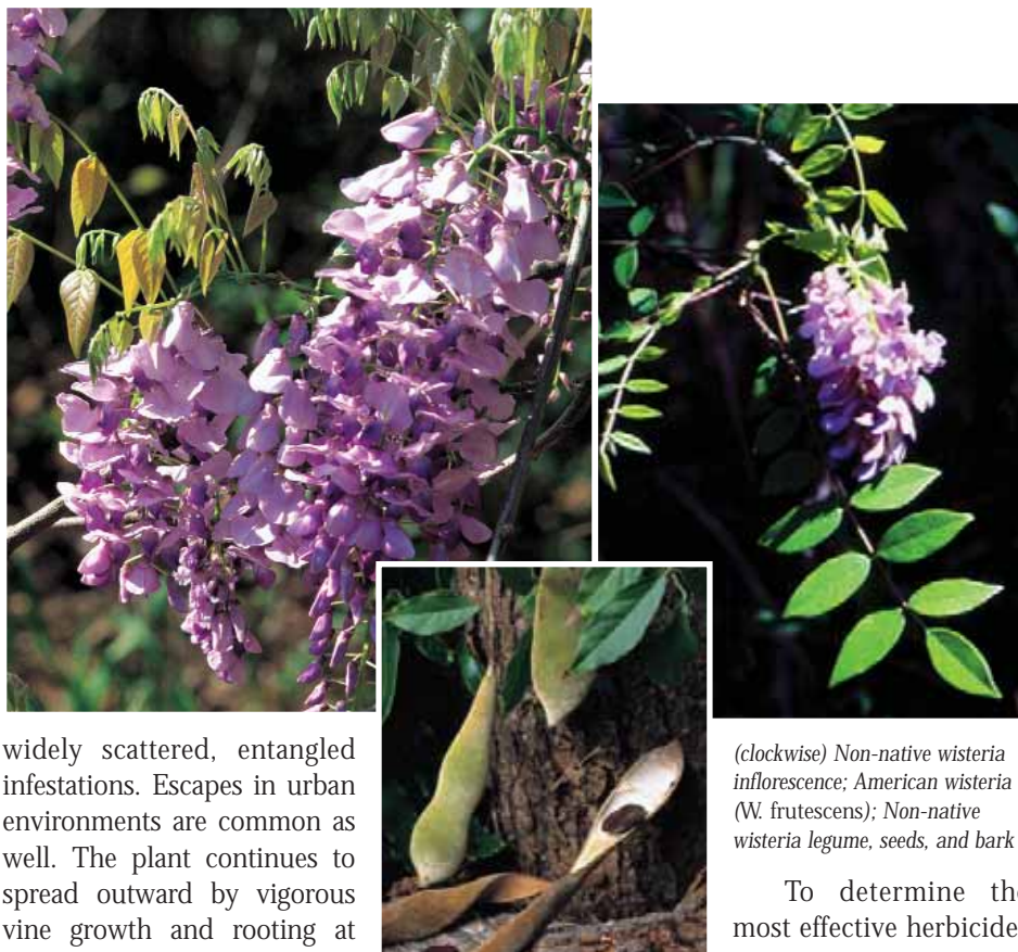
(clockwise) Non-native wisteria inflorescence; American wisteria ( W. frutescens ); Non-native wisteria legume, seeds, and bark

The oriental invasive wisterias were imported into the U.S. in the early 1800s as ornamentals and continue to be sold with many varieties, even though their invasiveness is widely recognized. Traditional plantings at now abandoned farm homes have yielded oriental wisterias occurring across the eastern region in