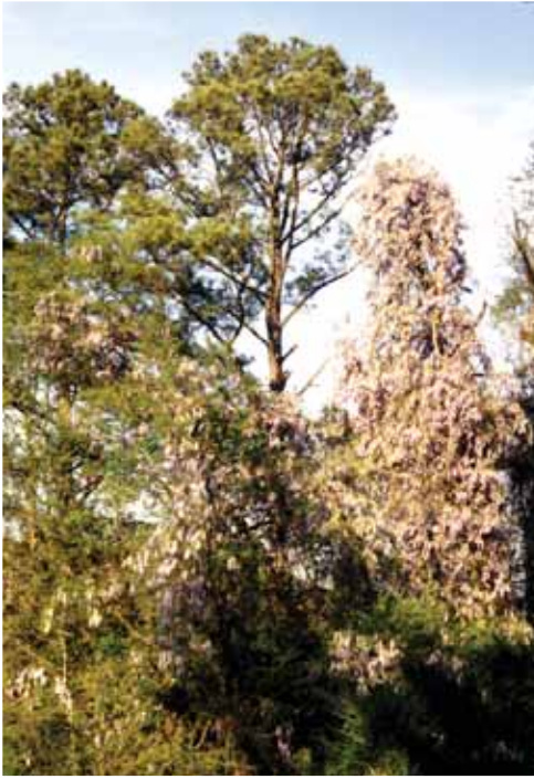
Non-native wisteria can climb into tall trees

tions of Tordon K, Garlon, Transline, and Accord (a.k.a., Roundup, glyphosate and others) in mid- to late summer and Arsenal in late summer gave near eradication with two applications 12 months a part. The active eradication of individual wisteria infestations at this time could, because of the limited spread rate, be an effective strategy in ridding the land of these invasive species.